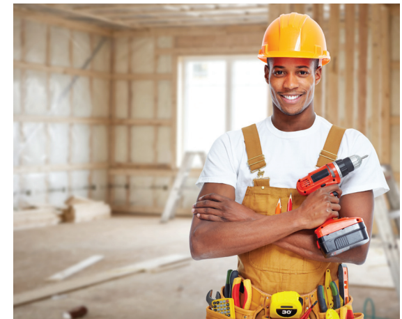
Building Trades & Construction Design Technology

Part-time and full-time hours are available for the above programs.