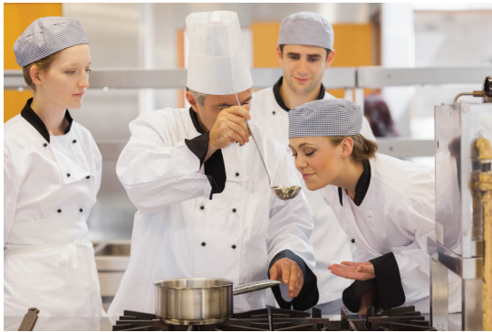
Fundamental Foodservice Skills

Lively Technical College partners with Vocational Rehabilitation to address employment needs such as career planning, internships/work based learning opportunities (paid and unpaid), completing resumes, interview skills, and job placement (with support).