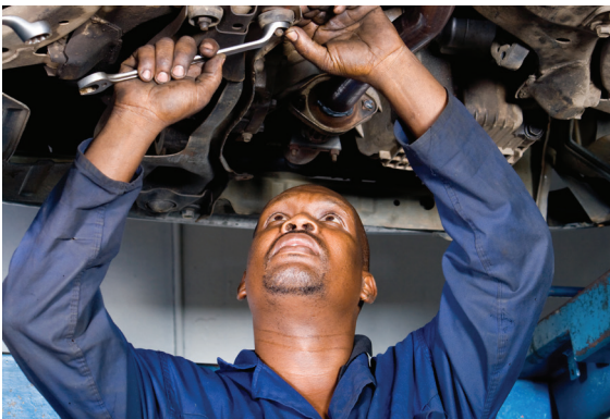
Automotive Service Technology

*All eligible students must have independent living skills.