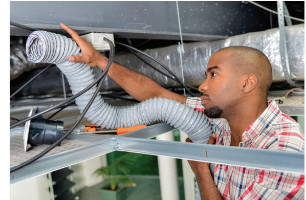
Heating Ventilation Air Conditioning/Refrigeration Technology